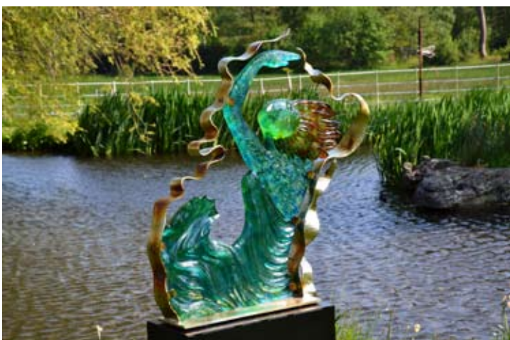
'Thalassa' - Julia Webster