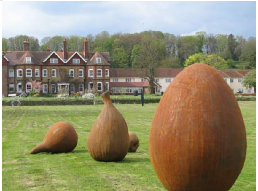
'Pear, Fig, Cherry, Large Egg' - Dick Budden