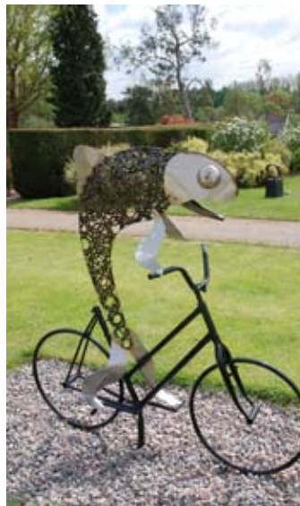
'Fish on a bike' - Daren Greenhow