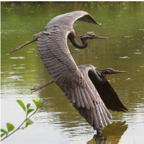
'Heron's Flying' - Lorne McKean