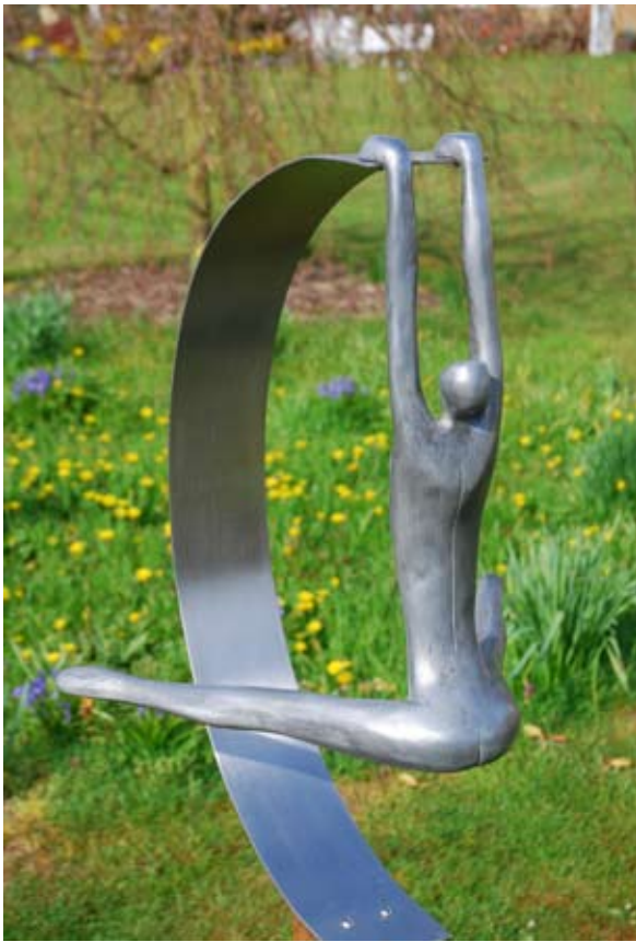
'Free Spirit I' - Jill Berelowitz