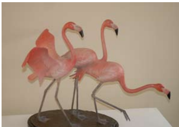
'Flamingoes' - Les Johnson