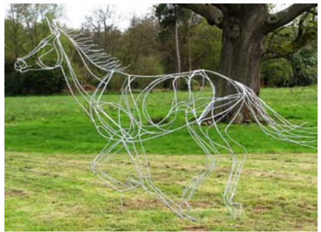
'Gallopig Thoroughbred' - Amy Goodman