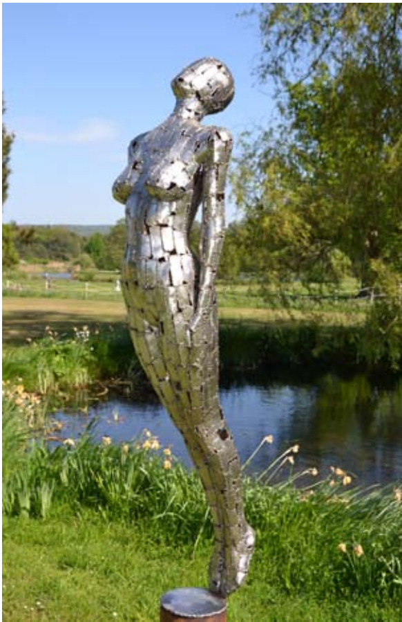
'Soaring Figure' - Rick Kirby